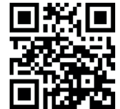
Microsoft Windows Phone