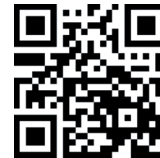
Google Android Play Store