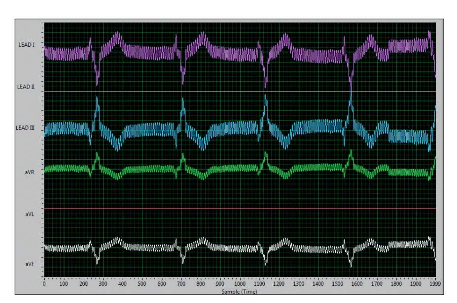
Fig 2: Sample ECG data

The first prototype (as in Fig 1) consists of an analogue/digital-converter evaluation module (Texas Instruments ADS1298 EVM) and a low-cost computing device (Raspberry Pi Model B) as well as a smartphone (Samsung Galaxy S3). Here, data is being collected via standard ECG cables (ECG Cable 10 Leads for Philips/HP) and converted into a digitized bit stream using an eight channel, 24bit AD-Converter (TI ADS1298). The ADS1298 provides a SPI (Serial Peripheral Interface) as well as an I2C (Inter-Integrated Circuit) interface which allows external devices to communicate with the AD converter. In this case, the SPI interface (DOUT signal) is used to read off the bit stream, with the CS and DRDY indicating that new data is available and the SCLK signal providing the timing required to synchronise the data transfer. As the AD converter of-